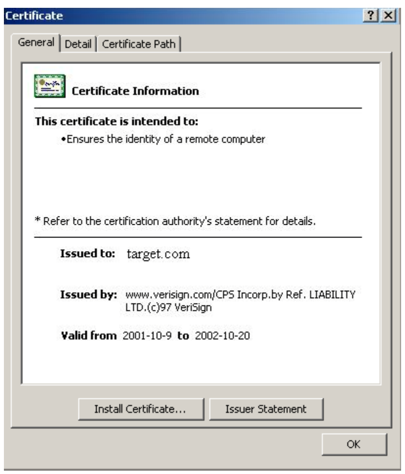
Figure 3: Certificate window