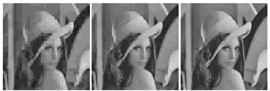
(a) Reconstructed, TH=256, (b) Reconstructed, TH=128, (c) Reconstructed, TH=64, PSNR=22.24dB PSNR=25.00dB PSNR=27.86dB